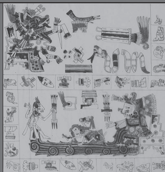
Mesoamerican Experiences of Illness and Healing

The Journal of the American Society for Ethnohistory