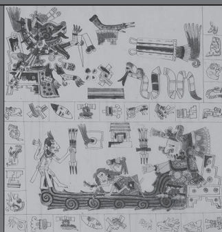
Mesoamerican Experiences of Illness and Healing

The Journal of the American Society for Ethnohistory